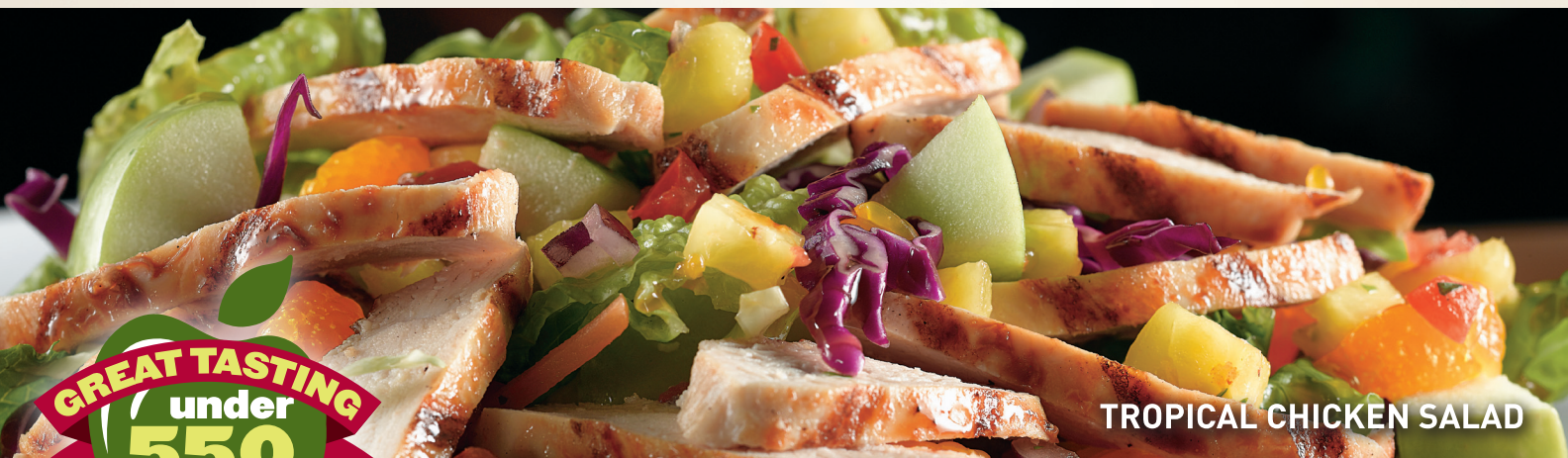
TROPICAL CHICKEN SALAD

Add toasted garlic bread basket for $XXX