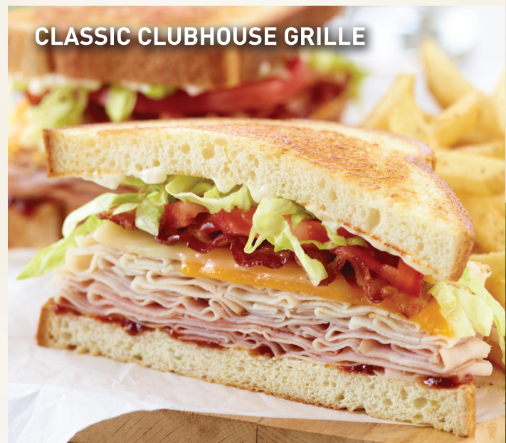
CLASSIC CLUBHOUSE GRILLE

Served on our toasted bakery bread toasted just right to bring out a hint of sweetness and piled high with smoked Virginia ham, shaved turkey, melted cheddar and Jack cheeses with Applewood smoked bacon. Lettuce, tomato, mayo and a drizzle of our signature BBQ sauce finish off this favorite. $XXX