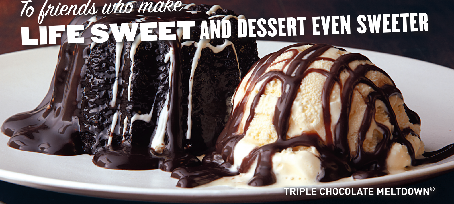
TRIPLE CHOCOLATE MELTDOWN®

To friends who make LIFE SWEET AND DESSERT EVEN SWEETER