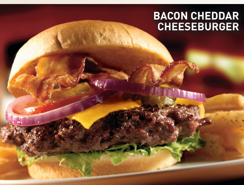
BACON CHEDDAR CHEESEBURGER

Applebee's twist on a classic... this burger is piled high with grilled onions, sautéed peppers & mushrooms, and smothered in creamy cheese sauce and aged white cheddar. Served on a toasted hoagie roll. $XXX