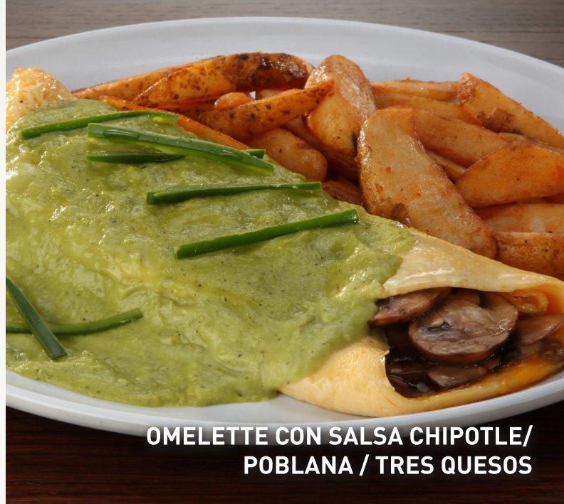
OMELETTE CON SALSA CHIPOTLE/ POBLANA / TRES QUESOS

A hot skillet full of scrambled eggs, fries, mushrooms, sautéed onions and peppers covered with melted cheddar and your choice of sausage or bacon. $XXX