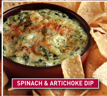
SPINACH & ARTICHOKE DIP